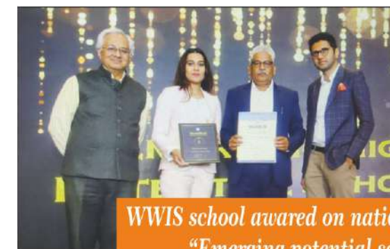
WWIS school awarded on national level for "Emerging potential school"