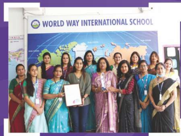
WWIS is accredited to BRITISH COUNCIL of United Kingdom