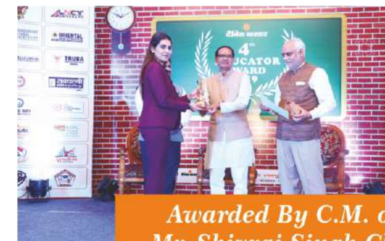
Awarded By C.M. of M.P. Mr. Shivraj Singh Chauhan

The future school is likely to increase creativity in the students. With the fact that a lot of information will be readily available to students without necessarily waiting for the tutor, they will be in better position to develop ideas and seek quick assistance from the global community.