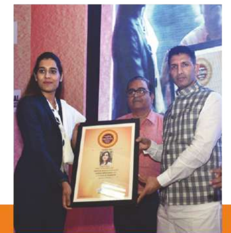
"Personality of the year" awarded by State Minister