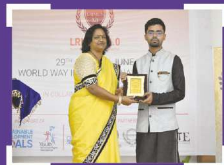
LRMUN appreciated WWIS for successful conduction of MUN