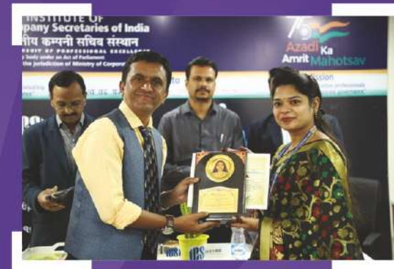
Institute of company secretaries of India (ICSI) awarded educators for their outstanding contribution