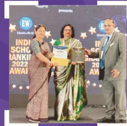
WWIS is awarded as “Emerging High Potential School” Under Grand Jury India Ranking 2021-22 by Education World