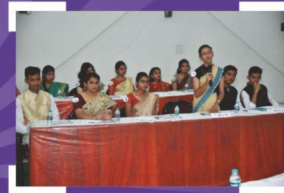
Children won cash prize and trophy for successful presentation of “Sansad” under the banner of Pandit Kunjilal Sansdiya Vidyapeeth